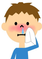
Runny nose or loss of smell